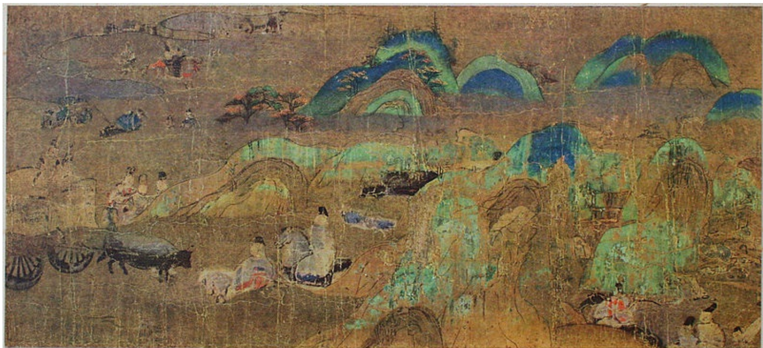
A SCENE FROM THE GENJI MONOGATARI EMAKI, CA.1130, IN THE TOKUGAWA MUSEUM, NAGOYA, JAPAN.

T he vice-governor of Iyo had the year after the death of Genji's father become vice-governor of Hitachi. His wife, the lady of the locust she 11 , had gone with him to his post. In that distant part of the realm she heard of Genji's exile. One is not to imagine that she was unconcerned, but she had no way of writing to him. The winds blowing down over Tsukuba were not to be trusted, it seemed, and reports from the city were few; and so the months and years went by. Although the period of his exile had not been fixed, he did finally return to the city. A year later the vice-governor of Hitachi also returned to the city.