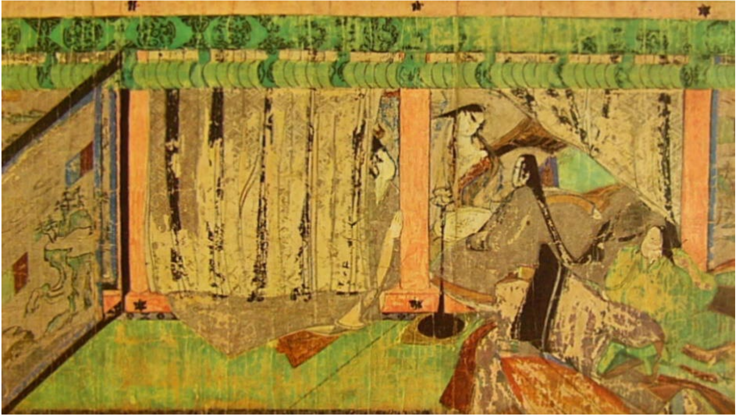
A SCENE FROM THE GENJI MONOGATARI EMAKI, CA.1130, IN THE TOKUGAWA MUSEUM, NAGOYA, JAPAN.

Many still mourned Kashiwagi, who had vanished before his time. Genji tended to feel very deeply the deaths even of people who had been nothing to him, and he had been fond of Kashiwagi and had made him a constant companion. It is true that he had good reason to be angry, but the fond memories were stronger than the resentment. He commissioned a sutra reading on the anniversary of the death. And he was consumed with pity for the little boy, whose agent he secretly thought himself as he made a special offering of a hundred pieces of gold. Tō no Chūjō was very grateful, though of course he did not know Genji's real reasons.